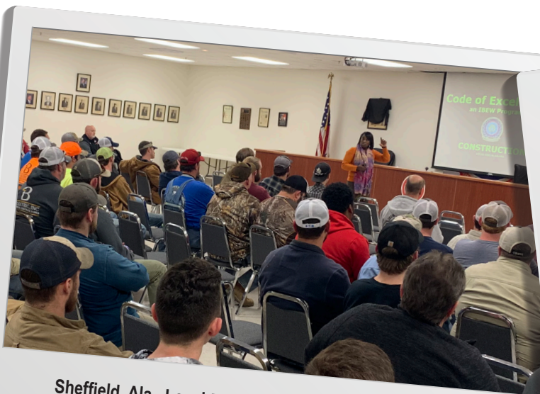
Sheffield, Ala., Local 558 demonstrated its commitment to the IBEW's core principles with Code of Excellence training in February.